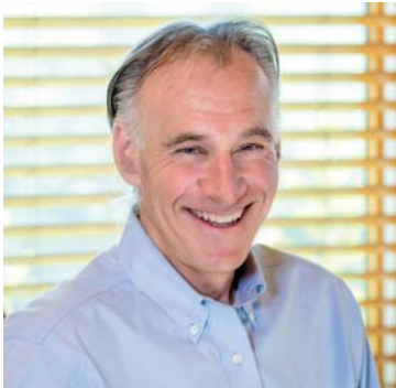
By Brian E. Coleman

An underused and unkempt space in most homes is the basement. But it is this very area that holds endless possibilities. Once you've decided to remodel your basement, these ideas will help raise its value and add some functional space for you to use and flaunt.