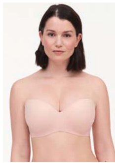
Norah Comfort Strapless Bra

smooth cups give me a natural roundness that flatters any sleeveless or strapless outfit I pack.